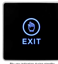
Blu-ray indication during standby