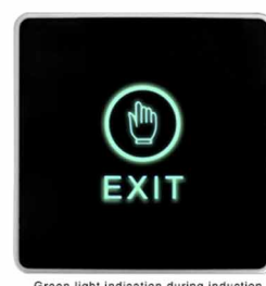
Green light indication during induction